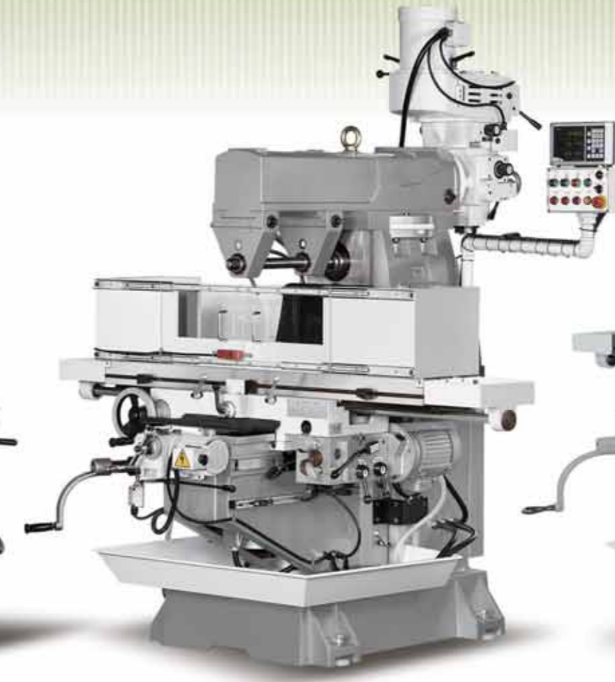
Machine Shown With Optional Accessories