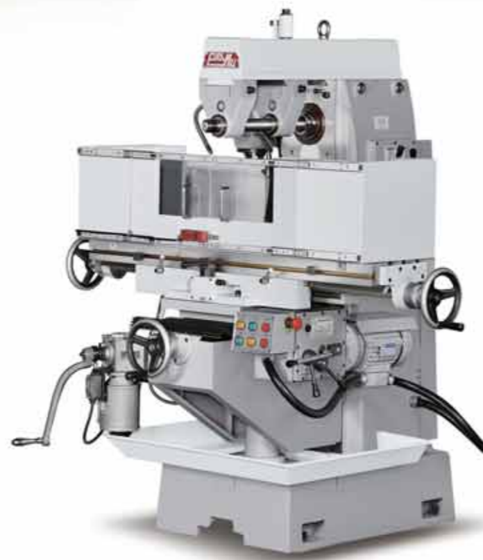
Machine Shown With Optional Accessories