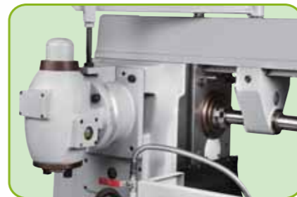
Vertical head is standard

X, Y-axis slideways are coated with "wear-resistance film" for smooth movement.